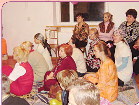
A section of devotees participating in Bhagavan's Birthday celebrations in Belarus.

programme at the Baranovichi Sathya Sai Centre. A video presentation of the Russian choir performing in Prasanthi Nilayam was screened. The celebrations ended with Bhajans and distribution of Prasadam.