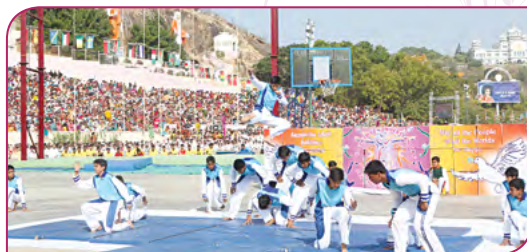
A display of skill and strength by the students of Sri Sathya Sai Higher Secondary School.

Daring feats on giant rings that followed showcased the skill and balance of the students of Sri Sathya Sai Higher