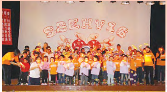
A presentation by children on Bhagavan's Birthday in Taipei.

Bhagavan's Birthday, which coincided with the 16th anniversary celebrations of the Sathya Sai Education in Human Values (SSEHV) programme in Taiwan, was organised on 18th November in the city of Taipei. About 200 people attended the celebrations. Following a brief introduction to the SSEHV programme,