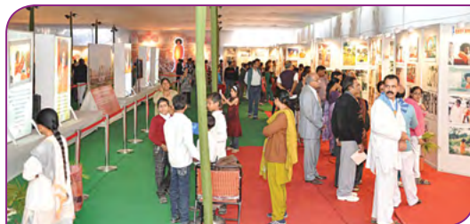
Sanathana Sarathi golden jubilee exhibition, "Journey with Sai" at Delhi-NCR.

Delhi: Sanathana Sarathi golden jubilee exhibition, "Journey with Sai" was organised at Sri Sathya Sai International Centre, Lodhi Road, New Delhi from 2nd to the 9th of December 2012 by Sri Sathya Sai Seva Organisation, Delhi-NCR. The exhibition provided a deep insight into the Mission of Bhagavan Sri Sathya Sai Baba, the work and activities of the Sri Sathya Sai Central Trust and specifically Sri Sathya Sai Seva Organisation, Delhi-NCR. People from different socio-economic, cultural and religious backgrounds visited the exhibition including several hundred school students from a dozen schools and many beneficiaries of the Sri Sathya Sai Village Integrated Programme. The exhibition was also visited by several eminent spiritual