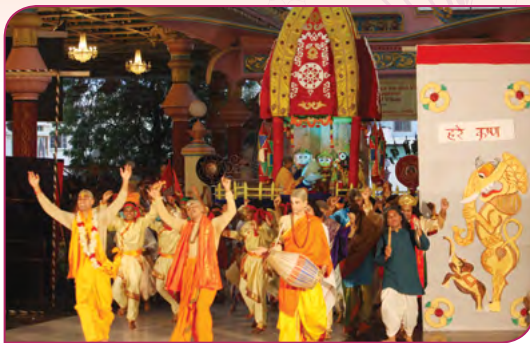
Drama on the life and message of Sri Krishna Chaitanya.

the message of Nama Sankirtan as the means of man's liberation. Sublime story of love for God, well-rendered devotional songs and dance routines and fabulous sets made the drama a very impressive