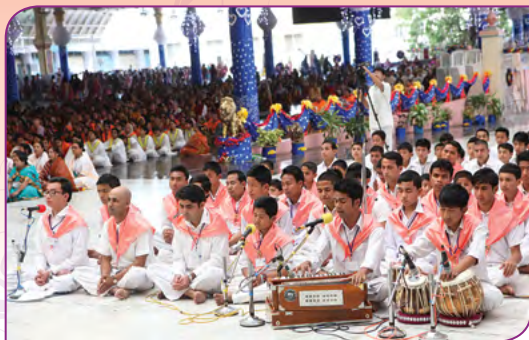
A devotional music presentation by Bal Vikas students and Sai Youth of Sikkim.

music programme, “Bhakti Samarpan” (devotional offering) in Sai Kulwant Hall on 28th December 2012 as part of their pilgrimage to Prasanthi Nilayam. Beginning their presentation with a prayer song, “Deva, Namo Deva” (Oh God, I offer salutations to You), they next presented a Rajasthani folk song and followed it up with a Qawali, “Sai Ke Darbar Mein” (in the court of Sai). They brought their presentation to a close with a group song, “Sai Hain Hamare Pran” (Sai is our life breath). This was followed by Bhajans which were also led by the Bal Vikas children of Sikkim. As the Bhajans continued, singers and musicians were felicitated and clothes were presented to them. The programme that started at 5.00 p.m. came to a close with Arati at 6.30 p.m. after distribution of Prasadam to all.