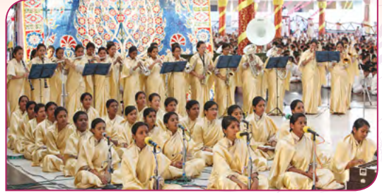
“Ananta Prema,” a fine devotional music presentation by Anantapur Campus students.

made by the students of Anantapur Campus on 13th January 2013 was based on the sublime teachings imparted to mankind by Lord Krishna in the immortal treatise, the Bhagavadgita. Beginning