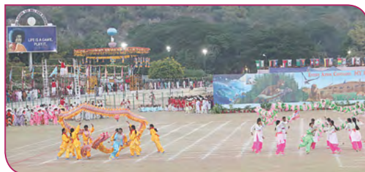
An excellent presentation of dragon dance by the students of Nursing and Allied Health Sciences, SSSIHMS, Whitefield.

Next to perform were the students of Nursing and Allied Health Sciences of Sri Sathya Sai Institute of Higher Medical Sciences, Whitefield who displayed their