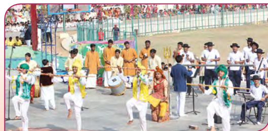
Prasanthi Nilayam Campus students performing Siva dance.

The students of Prasanthi Nilayam Campus, SSSIHL followed with feats on remote controlled miniature planes in the sky, while a huge structure depicting the universe in the hands of Sai was wheeled into the performing area. Their first item was a magnificent Siva dance which was