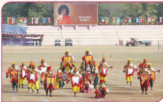
Folk dance of Karnataka by Brindavan Campus students.

The first presentation of the sports events was made by the students of Brindavan Campus, SSSIHL. Their items included an enchanting folk dance of