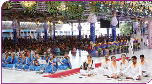
Devotees from European countries offering a devotional music presentation in Sai Kulwant Hall.

Bosnia and Herzegovina, Serbia, Croatia, Czech Republic, Slovakia and Germany made an excellent musical presentation, "Sai Vision" on 30th December 2012. Commencing their programme at 5.00 p.m. with the song, "We are here to call You, Swami," the singers presented in all 11 songs in English, German, Greek, Polish