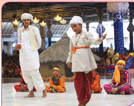
A musical drama, “Mayur Pankh” by Bal Vikas students and youth of Rajasthan.

Sri Sathya Sai Seva Organisation of Rajasthan presented a musical drama entitled, “Mayur Pankh” (peacock feather) on 29th December 2012 as part of Rajasthan devotees’ pilgrimage to Prasanthi Nilayam from 28th to 30th