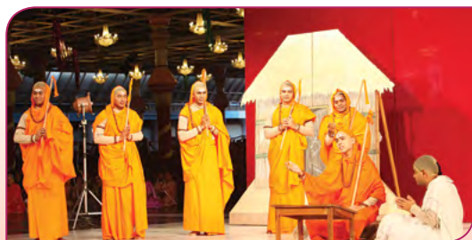
A scene from the drama, "Sankara Digvijayam."

The drama entitled, "Sankara Digvijayam" (Sankara's journey of conquest) presented by the students of Prasanthi Nilayam Campus portrayed the illustrious life story of Adi Sankara, who gave the message of Advaita (non-dualism) to the