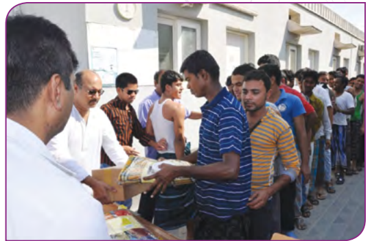
Distribution of gift packs on Bhagavan's Birthday.

On the auspicious day of Friday, 23rd November 2012, the Sathya Sai Service Organisation celebrated Bhagavan Baba's Birthday at Sri Sathya Sai Mandir, Dubai. The morning session, attended by about 200 Sathya Sai devotees, commenced with Omkaram and Suprabhatam, followed