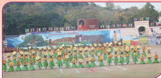
Colourful display by the students of Sri Sathya Sai Primary School.

Colour, music and rhythm characterised the presentation of Sri Sathya Sai Primary School students. Beginning their programme, with a giant backdrop depicting the scene of creation, they first performed a beautiful dance to the tune of a devotional song, "Vande Sivam Sankaram" (I offer salutations to Siva). What followed was an array of colourful formations made