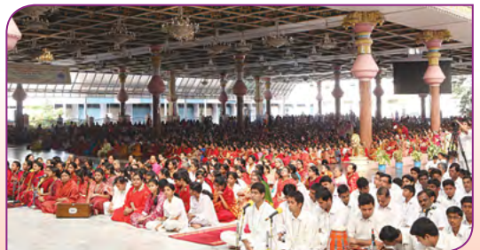
Participants attending a session of the convention in Sai Kulwant Hall.