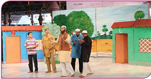
The drama, “Mera Jeevan Teri Sharan” highlighted the major role of God in man’s life.

came to realise through various events that God occupied the foremost place in man’s life and His grace could be earned only through total surrender. Introduction of the episodes of surrender of the Pandavas to Krishna and Vibhishana to Rama enhanced the significance of the underlying theme. Noble premise, excellent acting and dances by the students, good make-up and costumes made the drama a magnificent presentation.