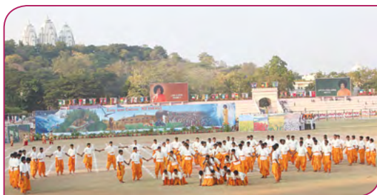
An impressive presentation by the students of Muddenahalli Campus.

Next, the students of Muddenahalli Campus, SSSIHL made eye-catching formations, depicting the advent of various Avatars of God, viz., Matsya (fish), Kurma (tortoise), Varaha (pig), Narasimha (half man, half lion), Parasurama, Rama,