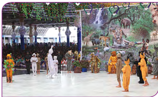
The drama, "A Crisis in Values" showcased the decline in values in human society.

S RI SATHYA SAI SEVA Organisation of Odisha organised an excellent cultural programme on 27th December 2012 as part of Odisha devotees' pilgrimage to Prasanthi Nilayam. The first item of the programme was a drama entitled, "A Crisis in Values" enacted by the inmates of Sai Karunalaya and Bal Vikas students of Odisha. The drama showcased the decline of values in human society through a discussion held in a court