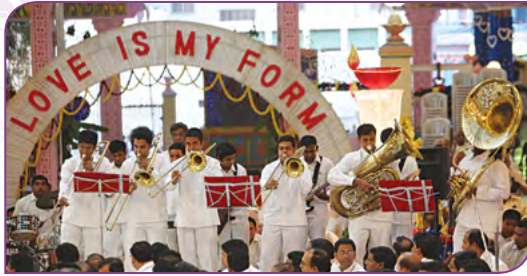
Institute alumni making their devotional music presentation.

After this, the alumni played a few scintillating tunes on their brass band. Beginning with an invocatory piece