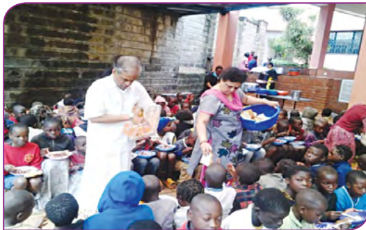
Serving food to needy children in Kenya.

THE SATHYA SAI CENTRE OF Nairobi celebrated Bhagavan Baba's Birthday by undertaking devotional and service activities for the nine consecutive Sundays preceding 23rd November 2012. During the nine-week programme, the morning devotional activities commenced with chanting Omkaram, Navaratnamala, Ashtottara