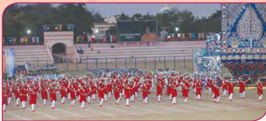
Anantapur Campus students making a beautiful formation.

balance. Acrobatics on rope on a high structure followed this. Their most dazzling item was the formations they made with dexterity and agility with luminescent LED lights. The formation of the word SAI with streaks of lights in the end earned them a prolonged applause from the spectators.