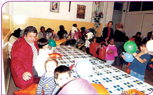
Sai volunteers distributed gift bags to celebrate Bhagavan's Birthday in Greece.

More than 100 Sathya Sai devotees attended Bhagavan Sri Sathya Sai Baba's Birthday celebrations at the Patission Centre in Athens, Greece on 23rd November 2012. The programme included