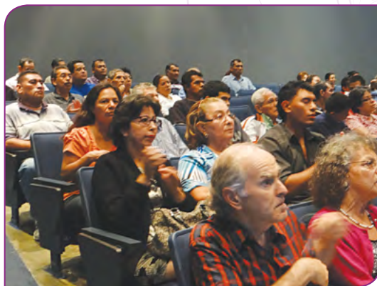
Devotees participating in Bhagavan's Birthday celebrations in El Salvador.