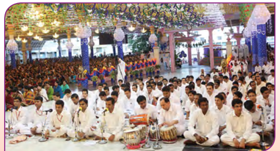
Devotional music programme by Primary School alumni.

These speeches were followed by beautiful songs interspersed with narration