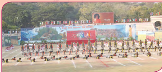
A beautiful formation by the students of Smt. Easwaramma English Medium School.

Next, the students of Muddenahalli Campus, SSSIHL made eye-catching formations, depicting the advent of various Avatars of God, viz., Matsya (fish), Kurma (tortoise), Varaha (pig), Narasimha (half man, half lion), Parasurama, Rama,